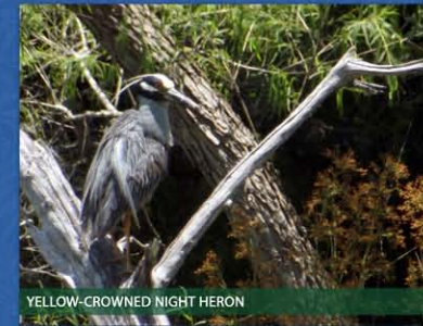
YELLOW-CROWNED NIGHT HERON