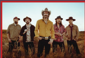
THE WILDER BLUE