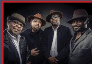
THE 80H PROJECT

THURSDAY, JULY 4TH, 2024 LOUISE HAYS PARK KERRVILLE, TEXAS