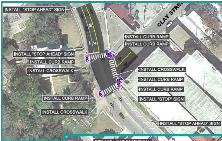
Clay and Water Street