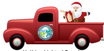
Holiday Lighted Parade Kerrville, Texas